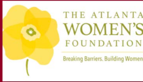
ATLANTA WOMEN'S FOUNDATION